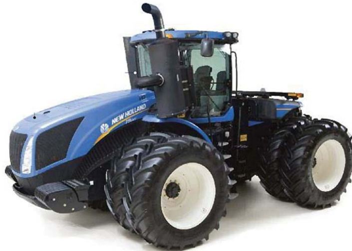
NEW HOLLAND T9.530 Diesel