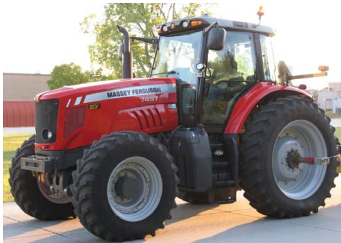
MASSEY FERGUSON 7497 Diesel