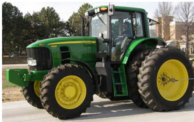
JOHN DEERE 7430 DIESEL