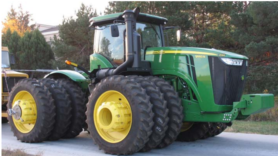
JOHN DEERE 9560R DIESEL