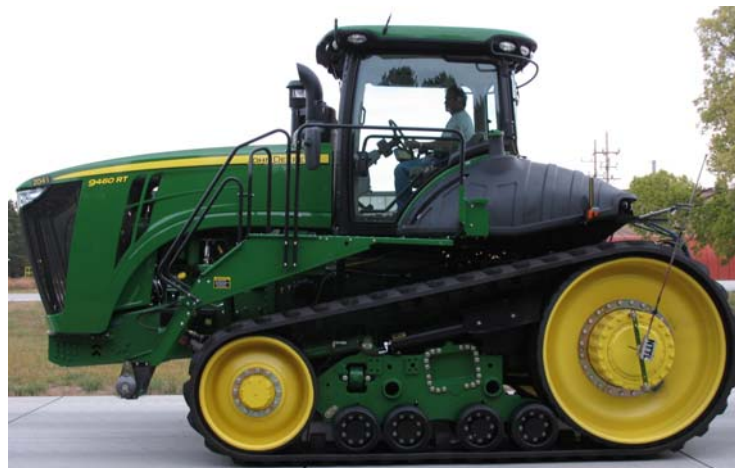
JOHN DEERE 9460RT DIESEL