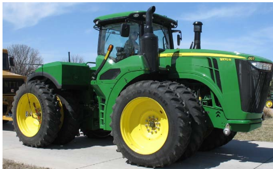
JOHN DEERE 9370R DIESEL