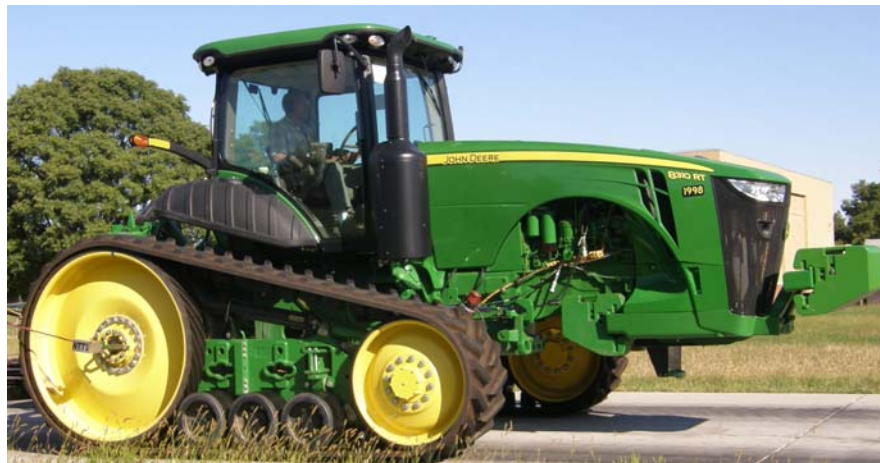
JOHN DEERE 8310RT DIESEL