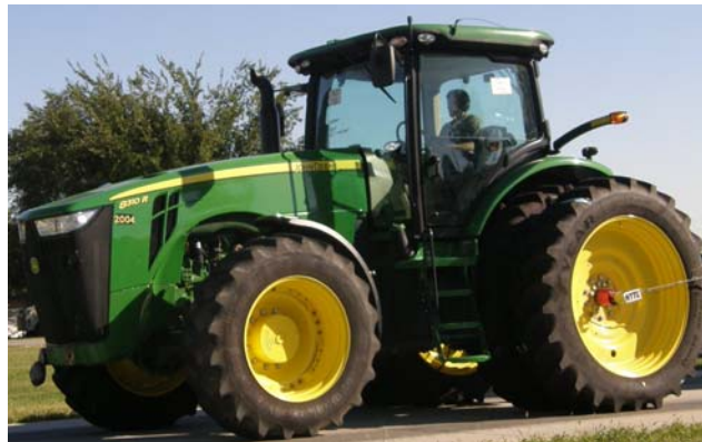
JOHN DEERE 8310R DIESEL