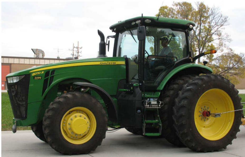
JOHN DEERE 8270R DIESEL