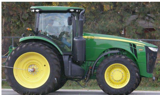
JOHN DEERE 8260R DIESEL