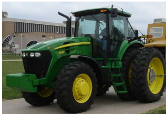
JOHN DEERE 7930 IVT DIESEL

Institute of Agriculture and Natural Resources University of Nebraska-Lincoln