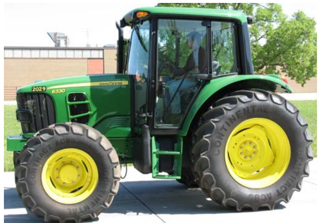
JOHN DEERE 6330 DIESEL

Clutch multiple wet disc hydraulically operated by foot pedal Brakes wet disc hydraulically operated by two foot pedals which can be locked together Steering hydrostatic Power take-off 540 rpm at 2143 engine rpm or 1000 rpm at 2208 engine rpm Unladen tractor mass 9790 lb (4441 kg)