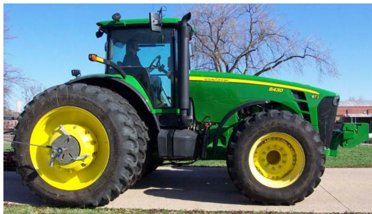
JOHN DEERE 8430 PS DIESEL

Institute of Agriculture and Natural Resources University of Nebraska-Lincoln