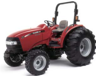
Case IH Farmall 55 Diesel