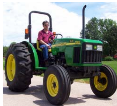
John Deere 5105 Diesel