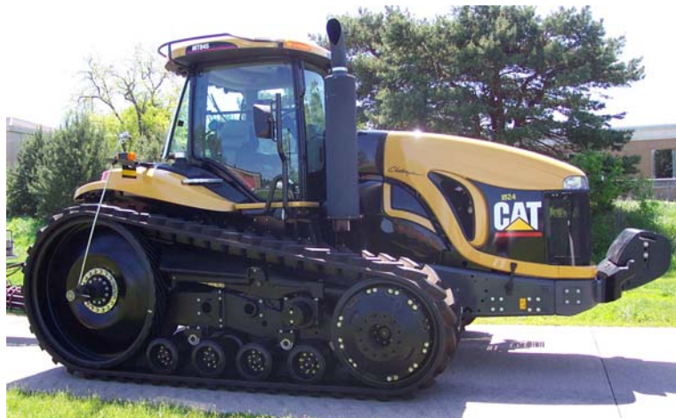
CHALLENGER MT845 DIESEL