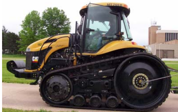
CHALLENGER MT765B DIESEL

Institute of Agriculture and Natural Resources University of Nebraska-Lincoln