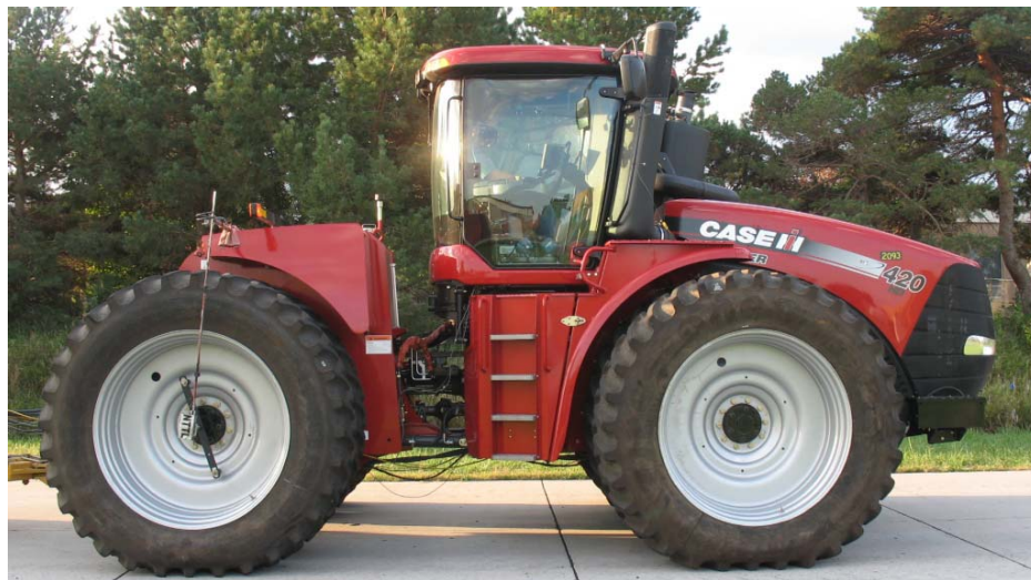
Case IH STEIGER 420 Diesel

Institute of Agriculture and Natural Resources University of Nebraska-Lincoln