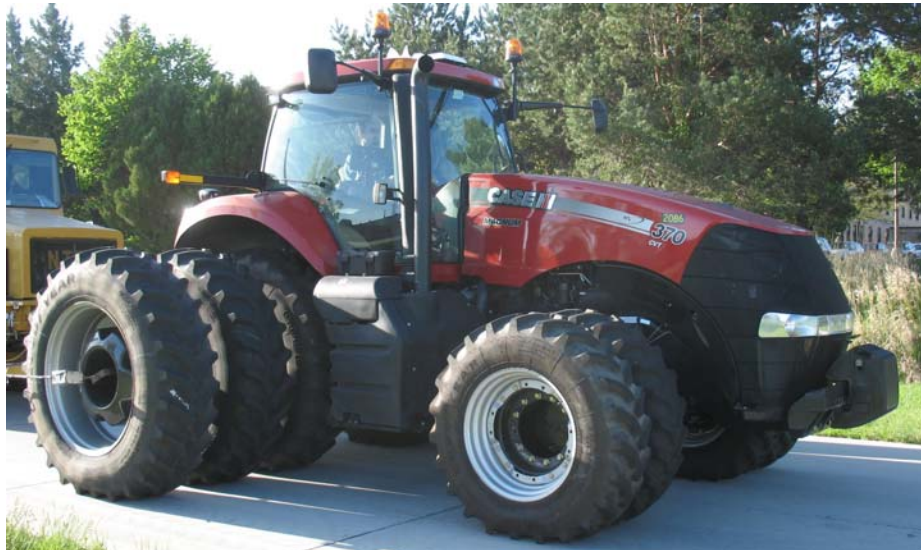
CASE IH MAGNUM 370 DIESEL