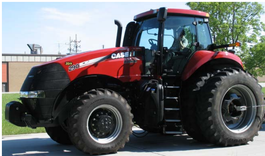
CASE IH MAGNUM 290 DIESEL