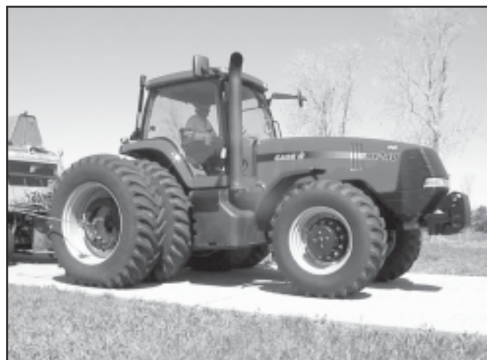
CASE IH MX 240 DIESEL