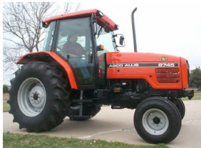
AGCO Allis 8745 Diesel