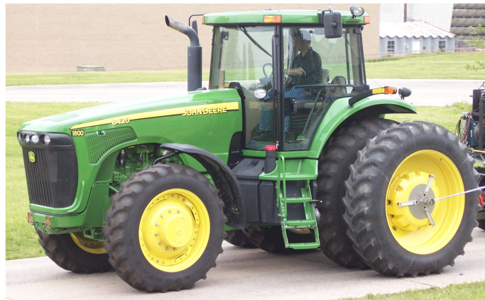
JOHN DEERE 8420 DIESEL