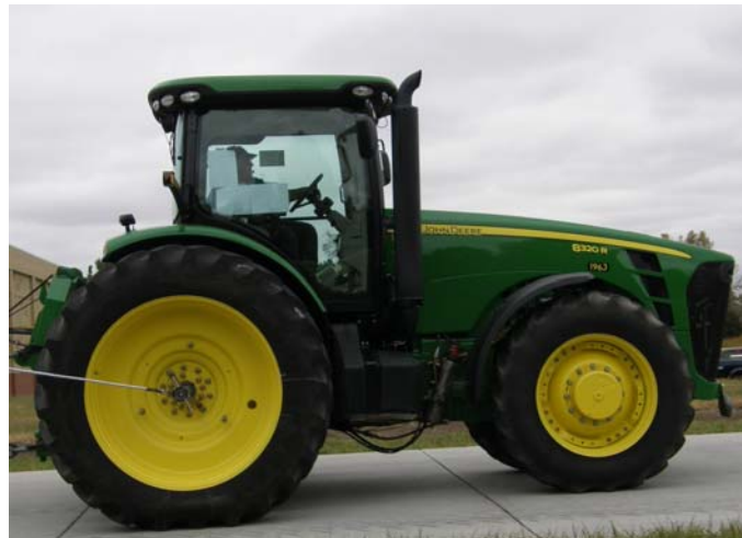
JOHN DEERE 8320R DIESEL