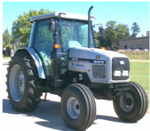
White 6510 Diesel