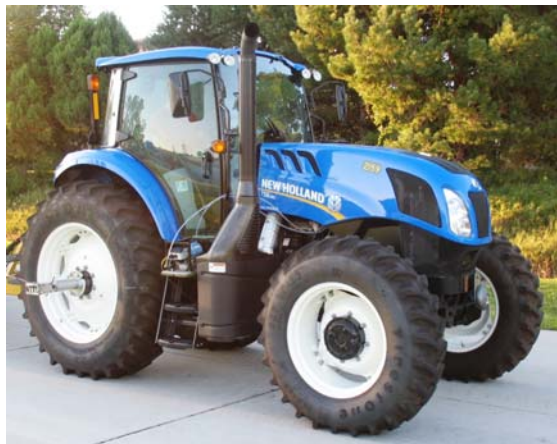
NEW HOLLAND TS6.140 DIESEL

Institute of Agriculture and Natural Resources University of Nebraska-Lincoln