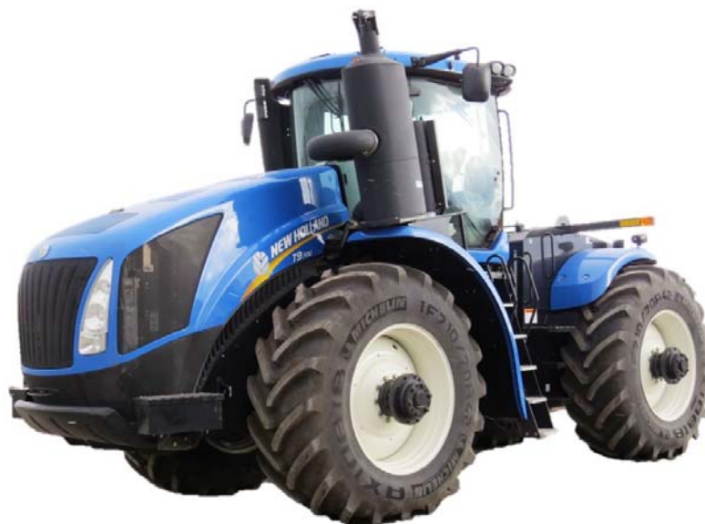
NEW HOLLAND T9.700 Diesel