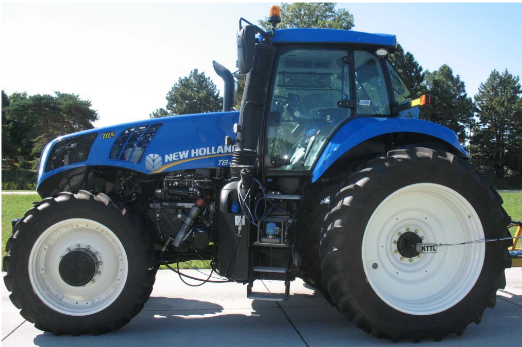
NEW HOLLAND T8.435 DIESEL