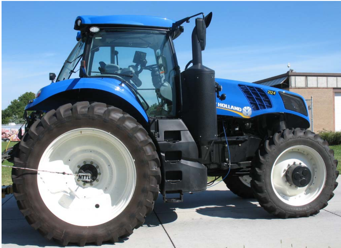
NEW HOLLAND T8.380 DIESEL