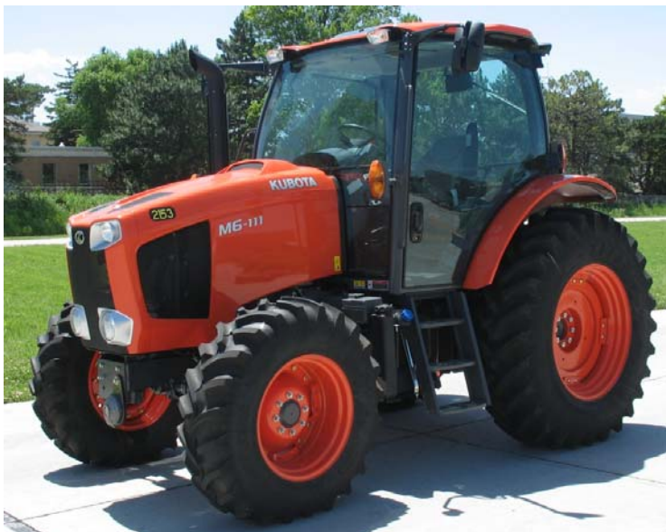
Kubota M6-111 Diesel Institute of Agriculture and Natural Resources University of Nebraska-Lincoln

nineteenth 8.77 (14.11) twentieth 10.64 (17.13) twenty-first 12.62 (20.31) twenty-second 15.44 (24.86) twenty-third 18.24 (29.35) twenty-fourth 22.13 (35.62) reverse 0.52 (0.84), 0.64 (1.03), 0.76 (1.22), 0.92 (1.48), 1.09 (1.75), 1.33 (2.14), 1.57 (2.53), 1.91 (3.07), 2.21 (3.56), 2.71 (4.36), 3.20 (5.15), 3.88 (6.25), 4.60 (7.41), 5.64 (9.08), 6.12 (9.85), 6.66 (10.72), 7.49 (12.05), 8.08 (13.01), 8.84 (14.23), 10.73 (17.27), 12.73 (20.48), 15.58 (25.07), 18.39 (29.60) 22.32 (35.93) Clutch multiple wet disc operated by foot pedal Brakes multiple wet disc operated by two foot pedals which can be locked together Steering hydrostatic Power take-off 540 rpm at 2405 engine rpm or 1000 rpm at 2389 engine rpm Unladen tractor mass 9830 lb (4459 kg)