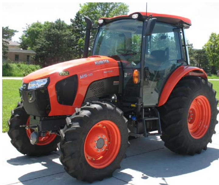
Kubota M5-111 Diesel Institute of Agriculture and Natural Resources University of Nebraska–Lincoln