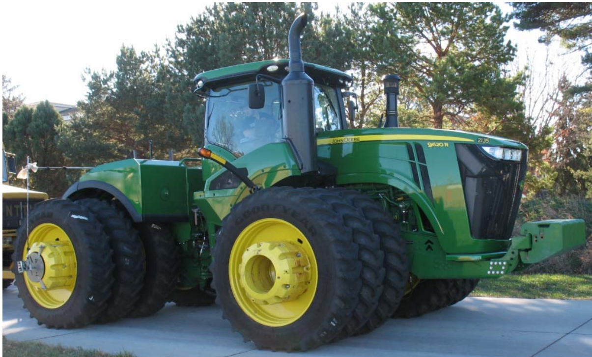
JOHN DEERE 9620R DIESEL