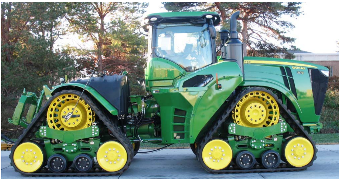
JOHN DEERE 9470RX DIESEL

Institute of Agriculture and Natural Resources University of Nebraska–Lincoln