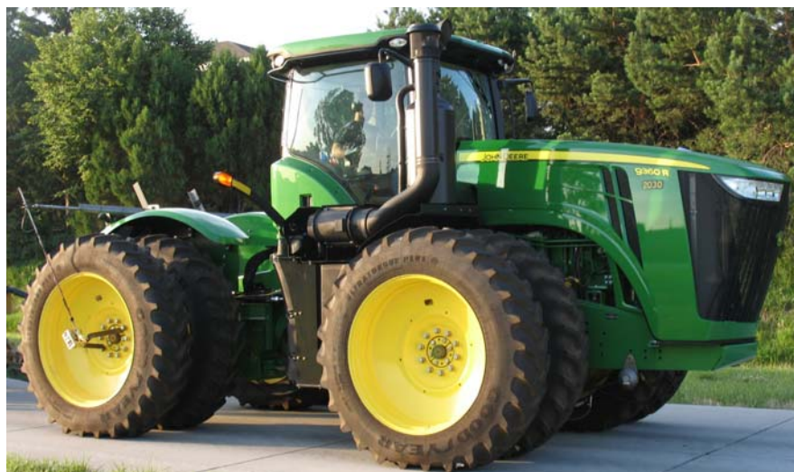
JOHN DEERE 9360R DIESEL