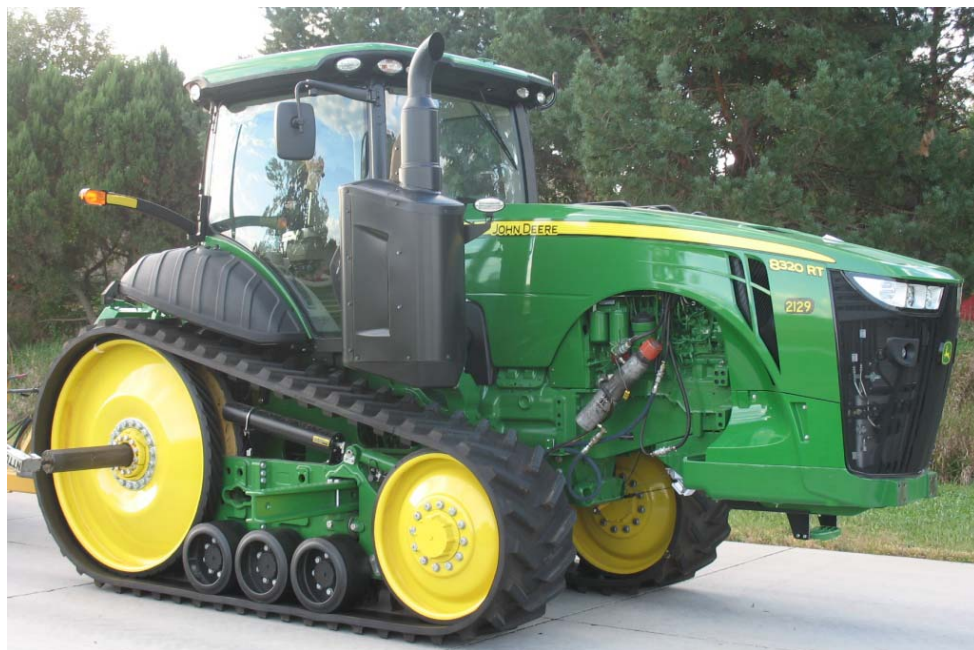
JOHN DEERE 8320RT DIESEL