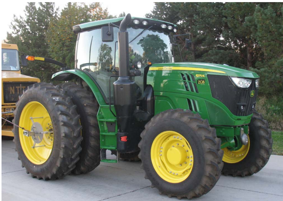
JOHN DEERE 6175R DIESEL