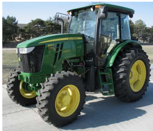
JOHN DEERE 6115D DIESEL Institute of Agriculture and Natural Resources University of Nebraska–Lincoln