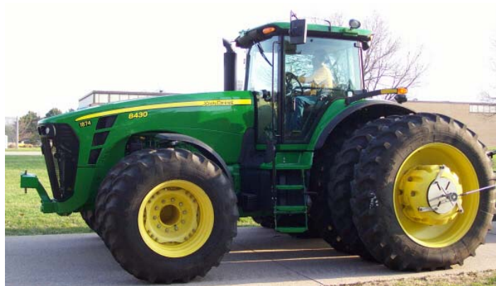
JOHN DEERE 8430 IVT DIESEL

Institute of Agriculture and Natural Resources University of Nebraska-Lincoln