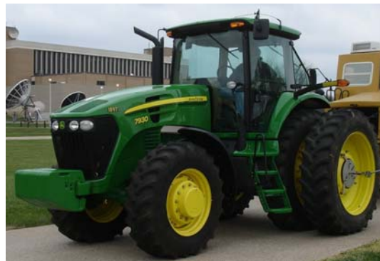
JOHN DEERE 7930 IVT DIESEL

Institute of Agriculture and Natural Resources University of Nebraska-Lincoln