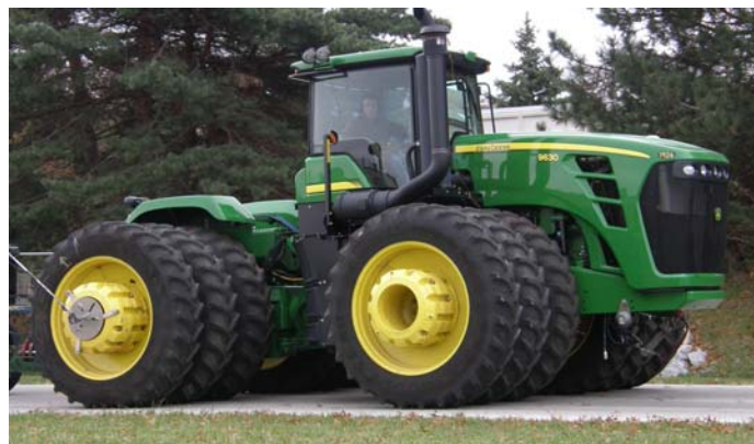
JOHN DEERE 9630 DIESEL