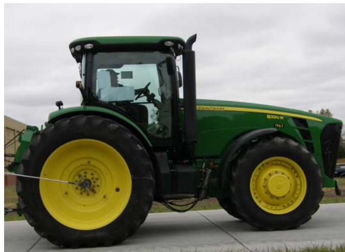
JOHN DEERE 8320R DIESEL