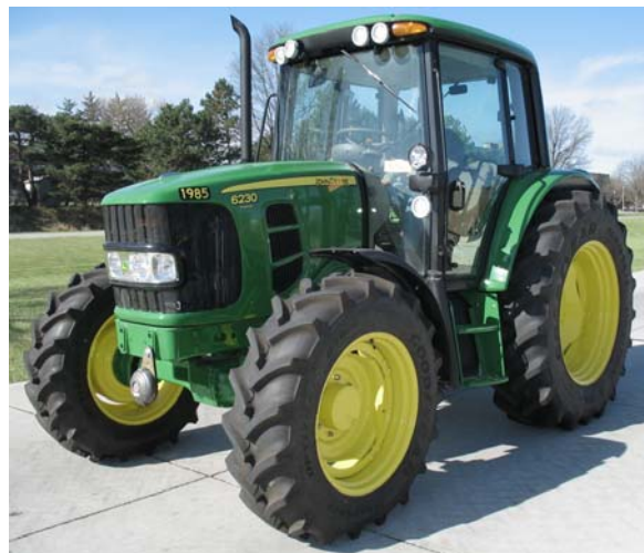
JOHN DEERE 6230 PREMIUM DIESEL Institute of Agriculture and Natural Resources University of Nebraska-Lincoln

Clutch multiple wet disc hydraulically operated by foot pedal Brakes wet disc hydraulically operated by two foot pedals which can be locked together Steering hydrostatic Power take-off 540 rpm at 2143 engine rpm or 1000 rpm at 2220 engine rpm. Unladen tractor mass 10280 lb (4663 kg)