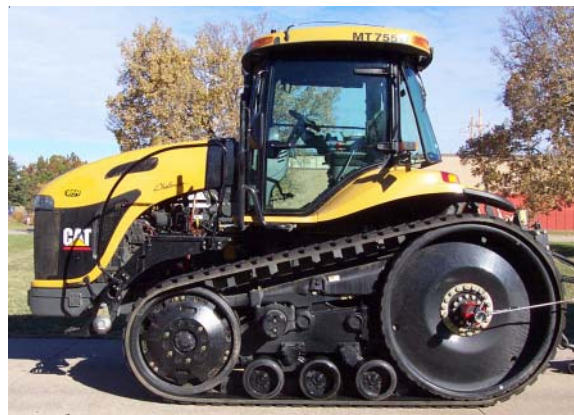
CHALLENGER MT755B DIESEL

Institute of Agriculture and Natural Resources University of Nebraska-Lincoln