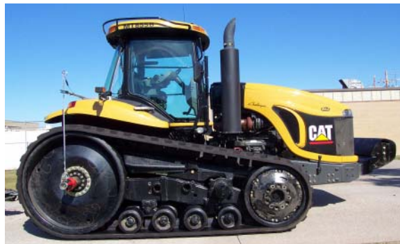
CHALLENGER MT855B DIESEL

Institute of Agriculture and Natural Resources University of Nebraska-Lincoln