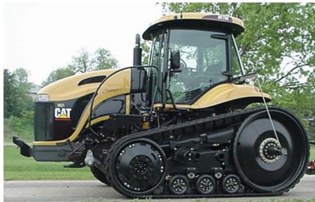
CHALLENGER MT735 DIESEL