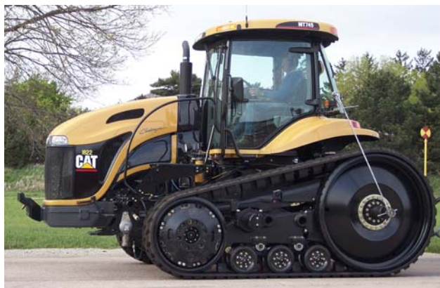
CHALLENGER MT745 DIESEL