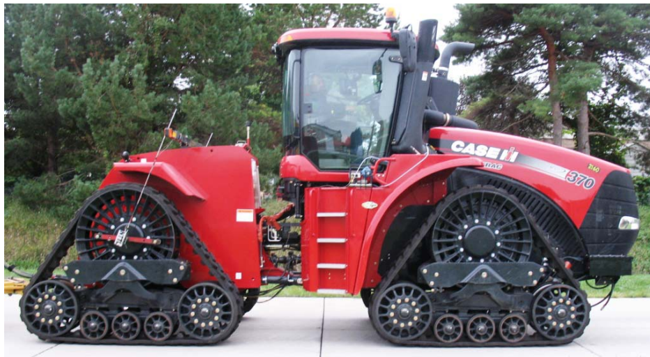
CASE IH 370 ROWTRAC Diesel

Institute of Agriculture and Natural Resources University of Nebraska-Lincoln