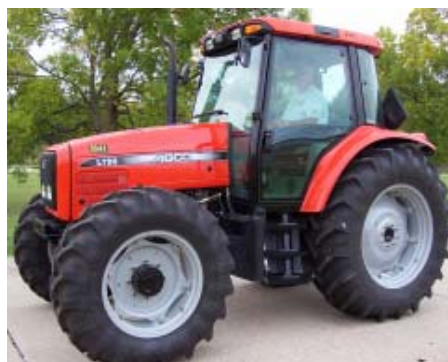
AGCO LT 90 Diesel